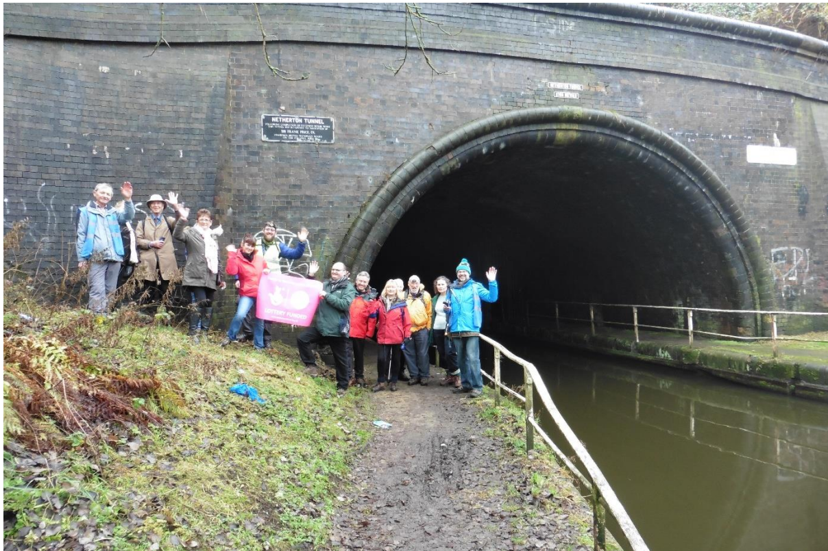
We had a head-count photo before entering the tunnel