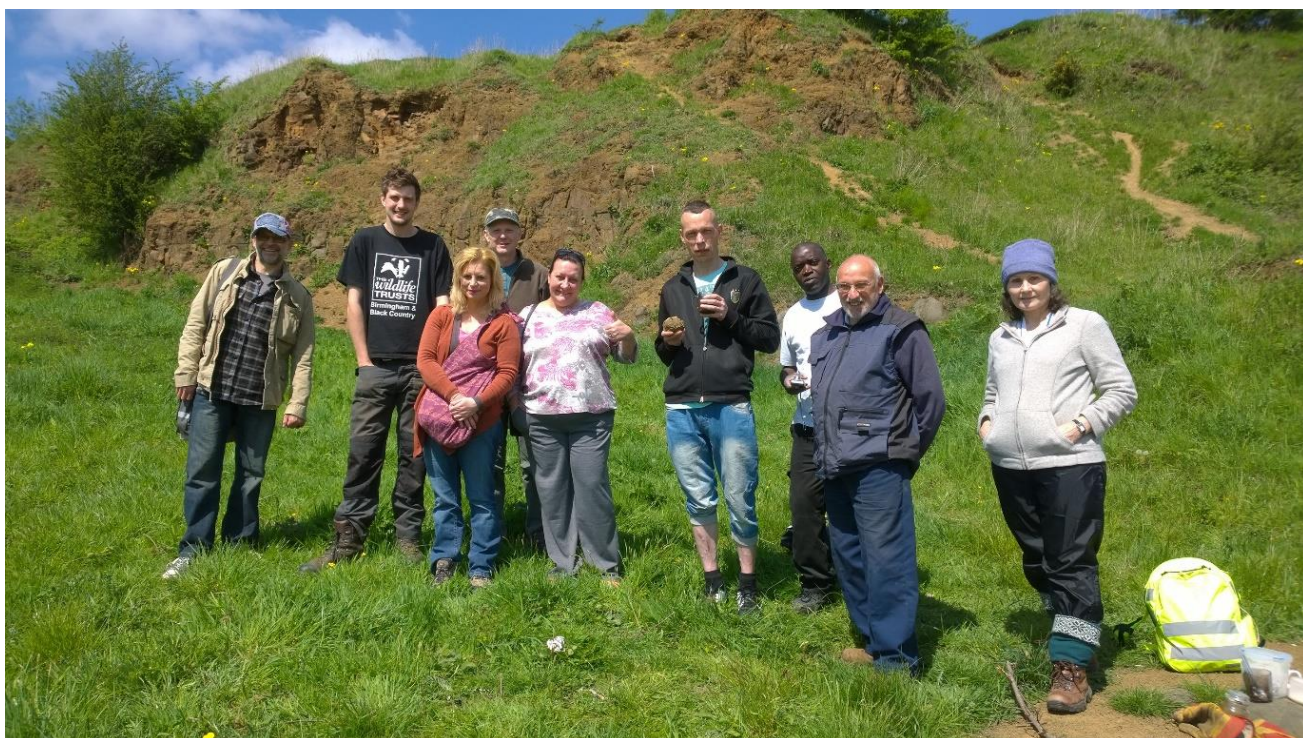
May 2016 – Geo-conservation event on Portway Hill