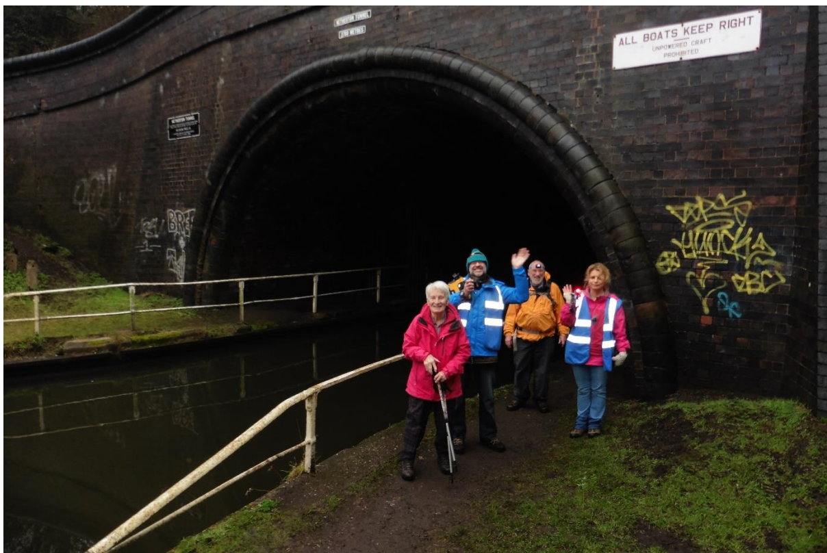
.... and at least some of us emerged at the other end!