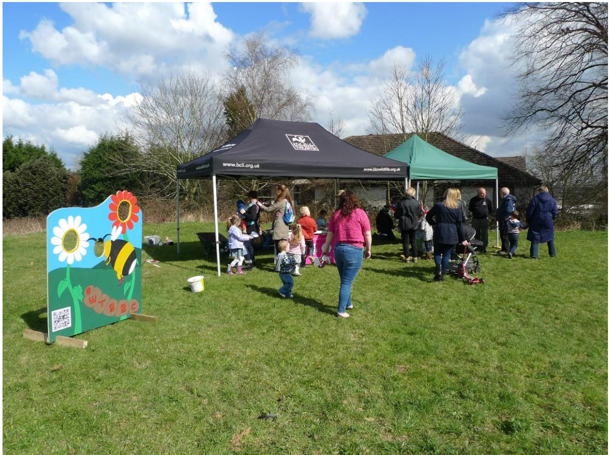
Another good turnout for the second of our Easter Holidays events, this time in Bury Hill Park