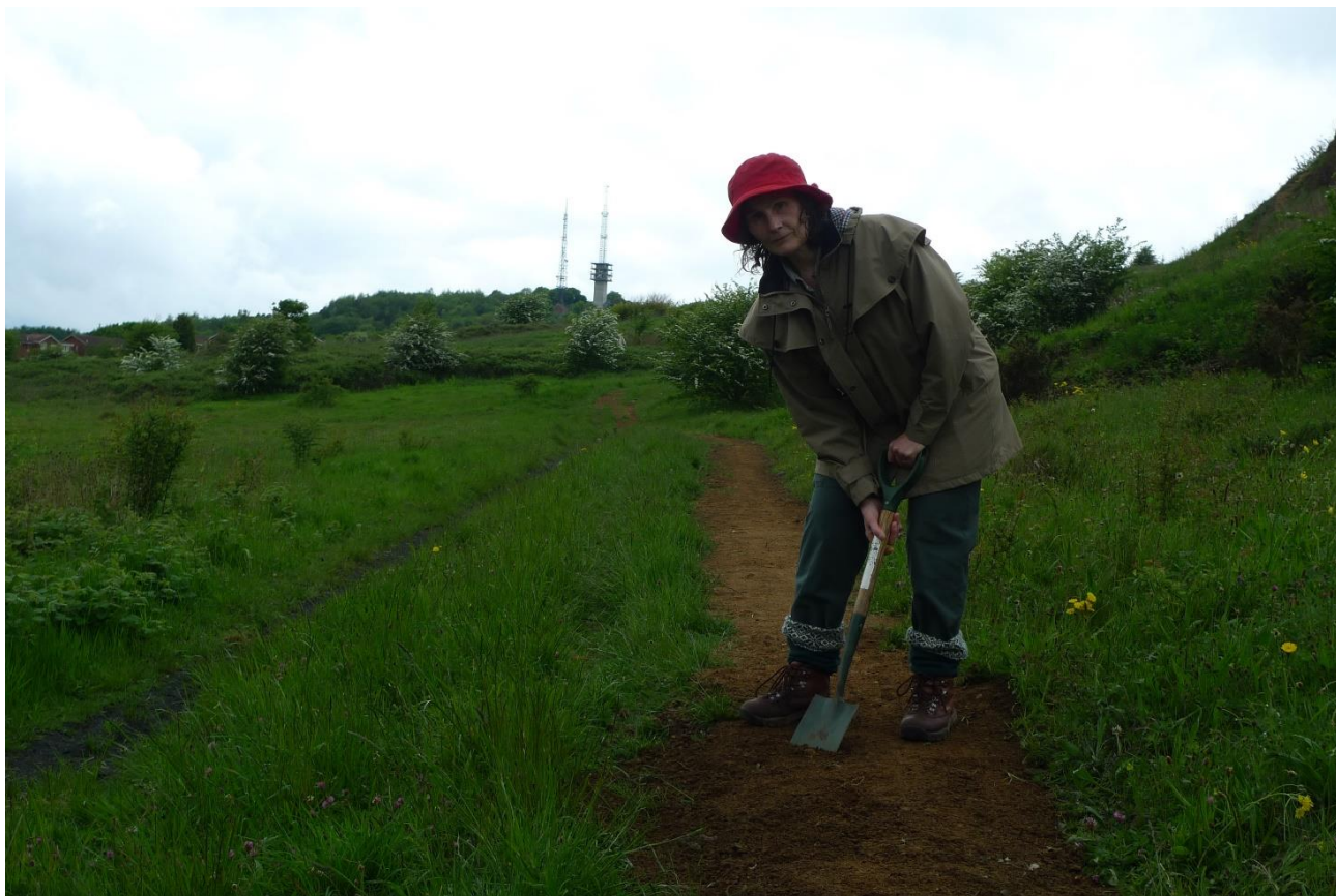
July 2016 - Family Fun Day and Nature Walk at Bury Hill Park