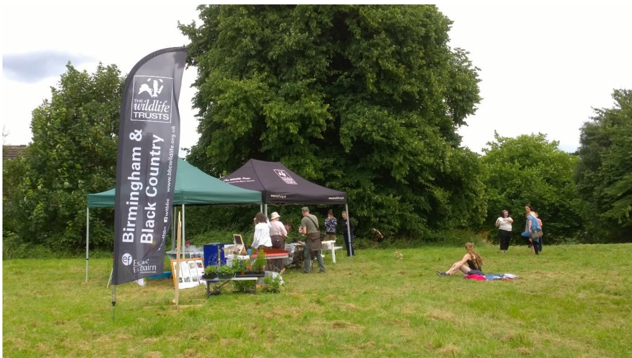
A repeat of our Easter event, this time on a much warmer day!