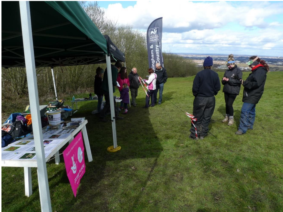
Our display included photographs of some of the many butterflies found on the hillside