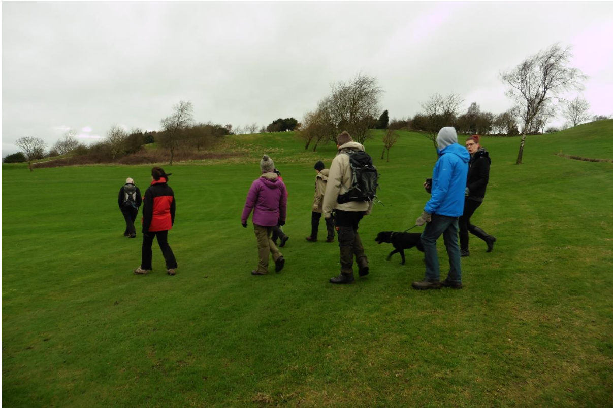
..... And negotiating Dudley Golf Course fairway