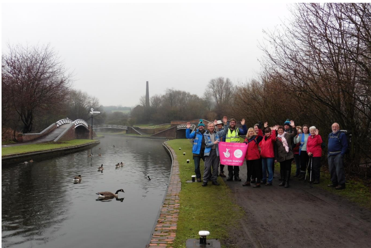
All present and correct as we pose for a group photograph at Bumble Hole