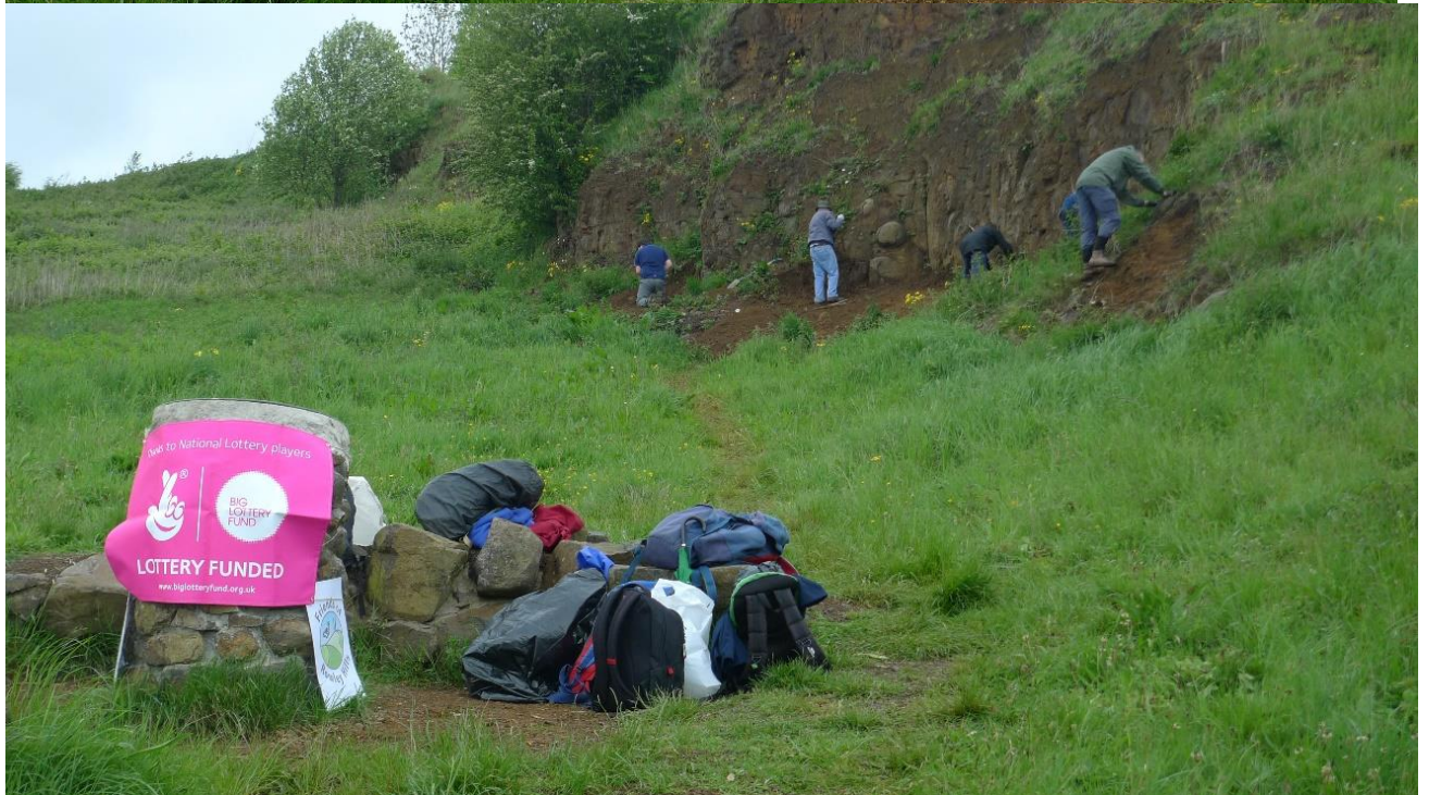
Clearing vegetation from the foot of the cliff enables visitors to get a closer look at the rock-face and the surplus material was used to consolidate the path