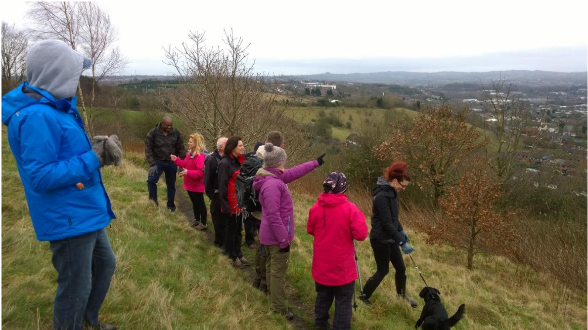
We got some stunning views towards Malvern and Clee Hills from here