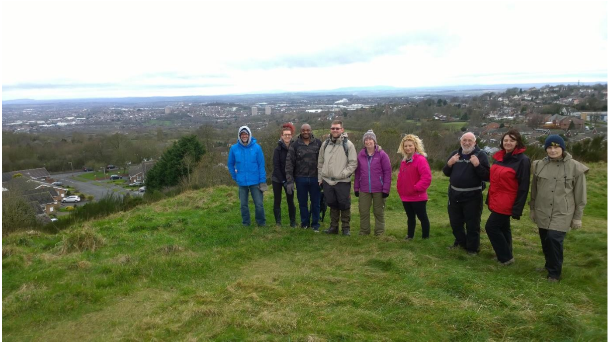
.... And posed for a group photograph on Darby's Hill