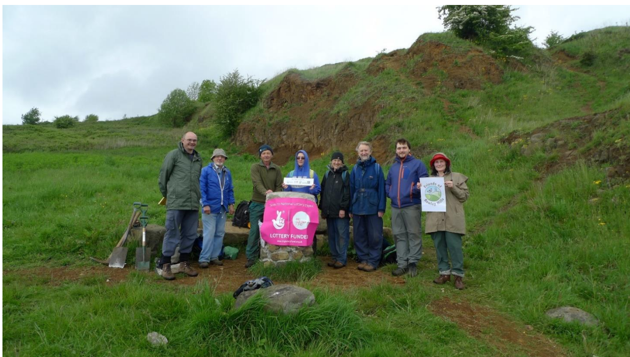
We were joined for this event by volunteers from the Black Country Geological Society